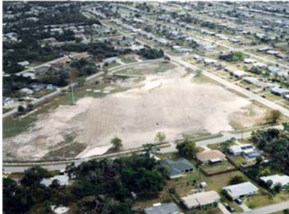
Neil Armstrong Elementary Hurricane Charley - August 2004 - Charlotte County Public Schools, Florida Modular City Report