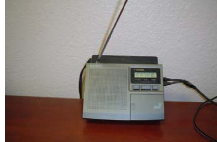
Hurricane Charley, Aug. 2004, Charlotte County Public Schools, Florida