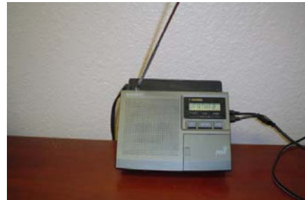
Hurricane Charley, Aug. 2004, Charlotte County Public Schools, Florida