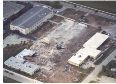
Charlotte High School - Hurricane Charley - August 2004 Charlotte County Public Schools, Florida Modular City Report