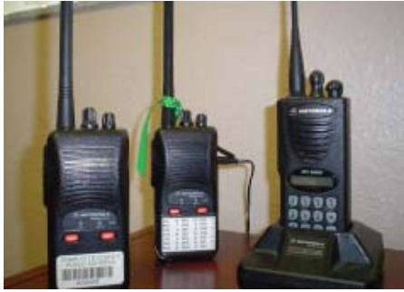
Hurricane Charley, August 2004, Charlotte Cty Public Schools, FL