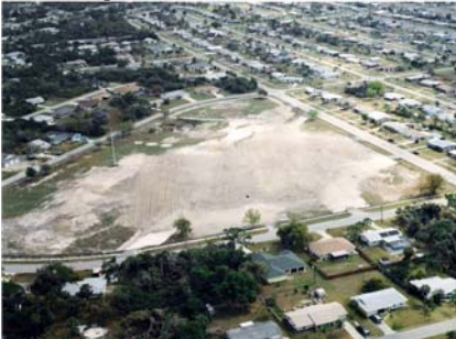
Neil Armstrong Elementary Hurricane Charley - August 2004 - Charlotte County Public Schools, Florida Modular City Report