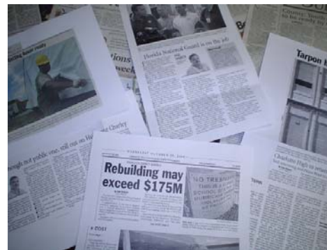
Hurricane Charley - August 2004 - Charlotte County Public Schools, Florida