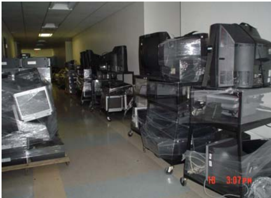
Charlotte High School - Hurricane Charley - August 2004 Asset Preservation Report Charlotte County Public Schools, Florida