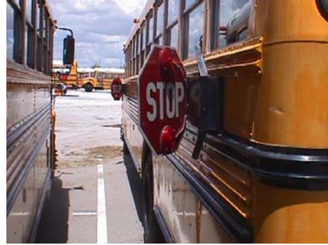
Punta Gorda Center – Transportation - Hurricane Charley – August 2004, Charlotte County Public Schools, Florida