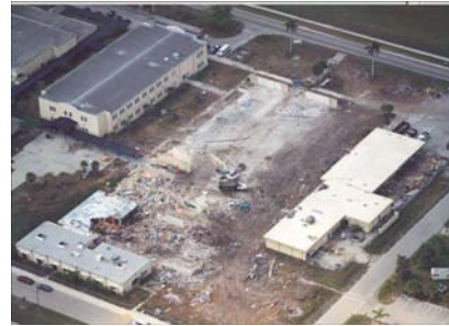
Charlotte High School - Hurricane Charley - August 2004 Charlotte County Public Schools, Florida Modular City Report