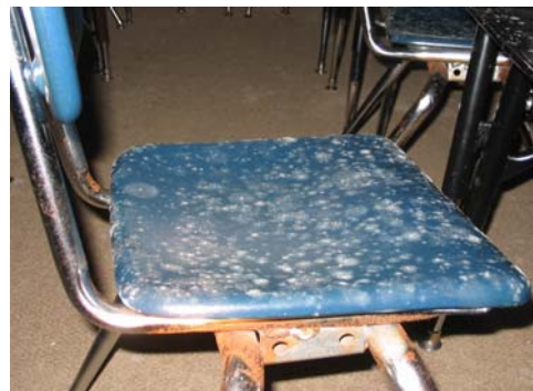
Neil Armstrong Elementary - Hurricane Charley - August 2004 Charlotte County Public Schools, Florida Mirco Assessment Report