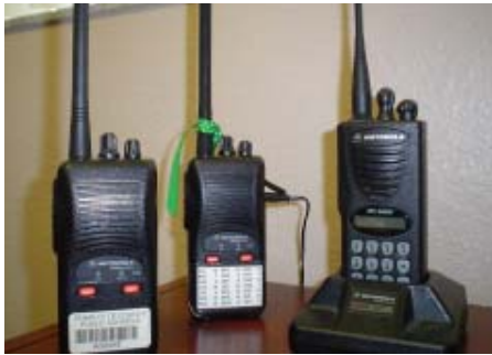
Hurricane Charley, August 2004, Charlotte Cty Public Schools, FL