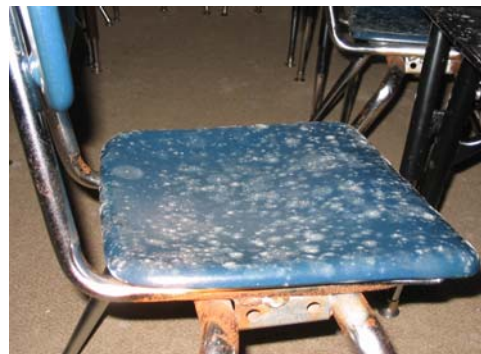
Neil Armstrong Elementary - Hurricane Charley - August 2004 Charlotte County Public Schools, Florida Mirco Assessment Report