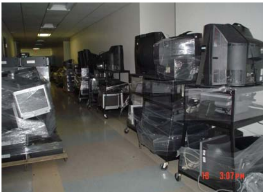
Charlotte High School - Hurricane Charley - August 2004 Asset Preservation Report Charlotte County Public Schools, Florida