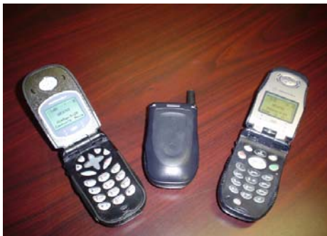
Hurricane Charley - August 2004 - Charlotte County Public Schools, Florida