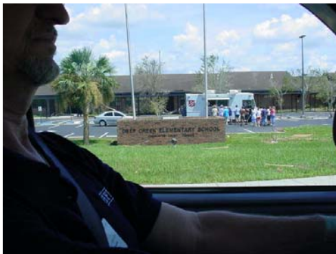
Deep Creek Elementary - Hurricane Charley-August 2004 Charlotte County Public Schools, Florida